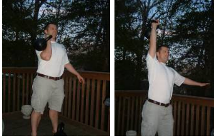
(That's me on my deck performing an overhead press with my 53-lb kettlebell From Online Sports)