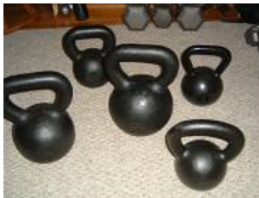
(Kettlebells are perfect for outdoor training)

2. Try Some Interval Training to increase fat loss: Look, the “fat-burning” zone is a myth. Sure your body does use fat as an energy source after 30 minutes of continuous exercise at a certain intensity but the sports scientists have shown us that shorter efforts of higher intensity exercise can be even more effective at decreasing your body fat percentage (did you ever wonder why sprinters are so lean without having to run for 30-60 minutes straight in their ‘target heart-rate zone’ ???). A great way to incorporate interval training into your summer training can be as simple as warming up for 5-10 minutes and then alternating 30 seconds of more intense effort with 30 seconds of a more moderate effort. You could do this on your mountain bike, road bike, doing hill sprints, kayak sprints, jump roping, sprints on the track, or even doing a bodyweight callisthenic such as jumping jacks. Enjoy!