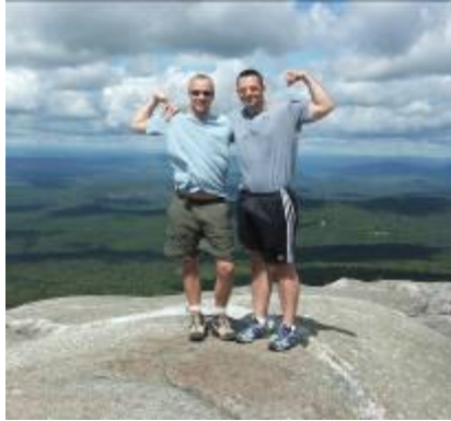
(One of my clients and me on Mount Cardigan)

6. Go for obstacle walks: A cool way to add some variety to your routine is to mix in some bodyweight calisthenics such as squats, push-ups, and jumping jacks into your summer walks to increase calorie expenditure and challenge your body. Walking on a treadmill is boring and predictable. Going for an obstacle walk through your local park can be a lot more enjoyable and the “chaos” of walking outside could be the right kind of variety you have been looking for.